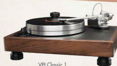
VPI Classic 1

YOUR Analog Superstore FOR MORE THAN TWENTY YEARS