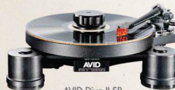
AVID Diva II SP