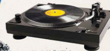
Music Hall USB-1