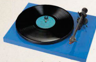
Pro-Ject Debut Carbon